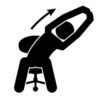
Hold for 20 sec. each side