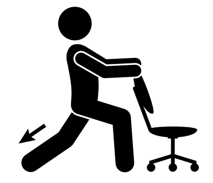
Hold for 10 sec. each side