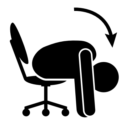
Hold for 10 sec. 2 times